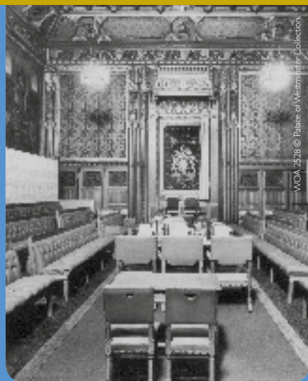
WOA 2578