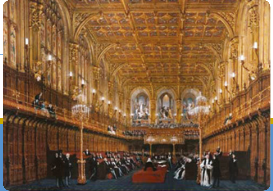
WDA, 2940 © Palace of Westminster Collection

The chamber after the number of bishops entitled to sit had been limited to 26 – it had been rebuilt by Barry and Pugin following the Great Fire of 1834